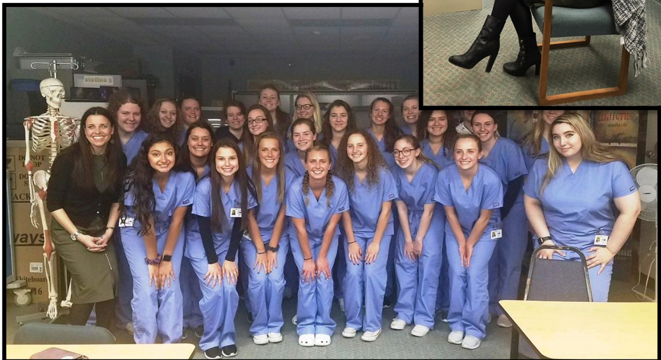
Indiana Secretary of Career Connections and former Mayor of LaPorte visited our school and particularly inspired our Health Careers students. She is seen with our students above.